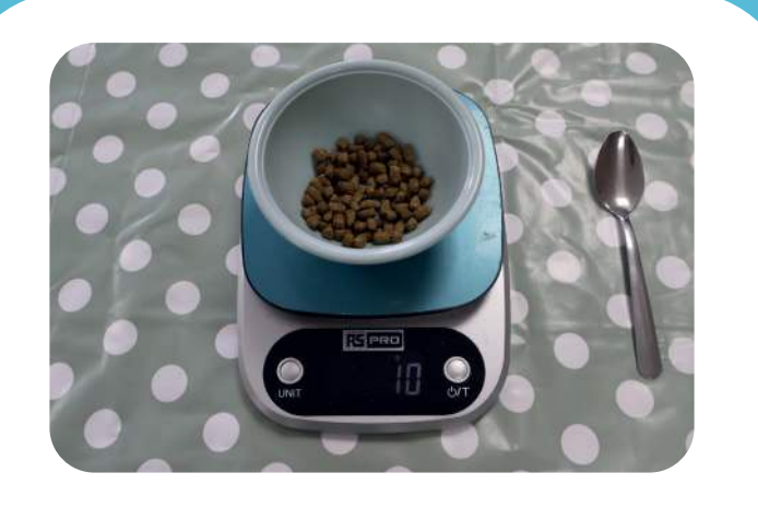
1. Weigh out the correct amount of nuggets for the weight of your patient (10g/kg bodyweight). Feed a maximum of 10ml/kg bodyweight per syringe feeding session.