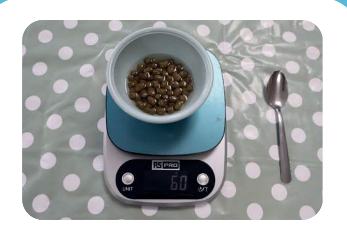
2. Add water to the bowl of nuggets at a ratio of 5:1 (for example 50ml water to 10g nuggets).